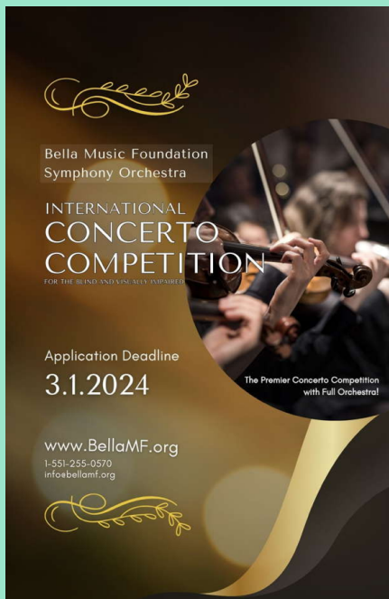
BMF 2024 Concerto Competition poster

The application and preliminary round video deadline for the Bella Music Foundation's International Concerto Competition for the Blind and Visually Impaired is 1 March 2024. Winners will have the unique opportunity to showcase their talents as soloists, performing a concerto with the foundation's full professional orchestra, the BMF Symphony Orchestra, during the BMF International Music Festival for the Blind on 28 April 2024 at the Barrymore Film Center in Fort Lee, New Jersey, USA. Further information: bellamf.org