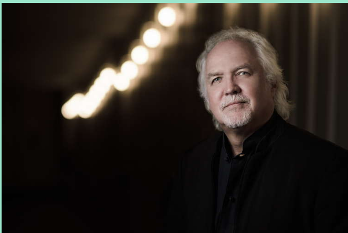
Donald Runnicles.

Scottish conductor Donald Runnicles (born 1954) will become the new chief conductor of the Dresden Philharmonic in 2025. Runnicles will take up the post in the 2025/26 season, but will already lead the Dresden Philharmonic as chief conductor designate in the 2024/25 season.